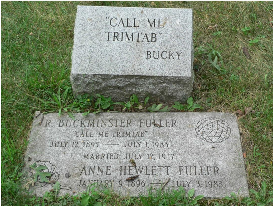
Grave of Buckminster Fuller

So what if he's referring to a ship (Queen Mary). Could be an airplane, too.